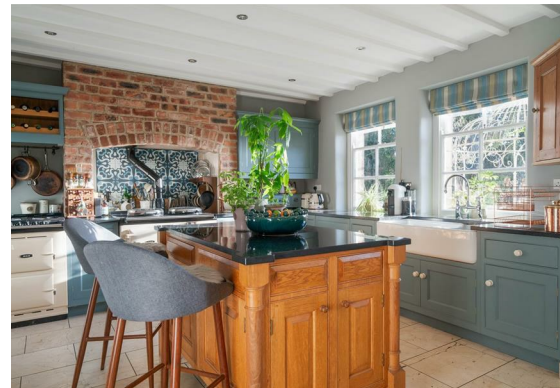
Dales and Peaks ForwardMove - Please read